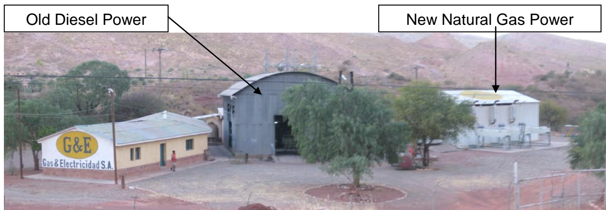
Camargo Power Plant in Camargo, Chuquisaca, Bolivia

power plant is owned, managed, and currently operated by the local energy distribution company COSERCA 4 . However, according to G&E S.A. records, G&E S.A. operated the diesel engines to produce energy from May 4, 2004 until April 19, 2007. During this period, COSERCA provided G&E S.A. the diesel fuel to operate the plant and G&E S.A. kept a close manual record of the energy production. Thereafter G&E S.A. copies the electricity generation data from COSERCA's manual registry.